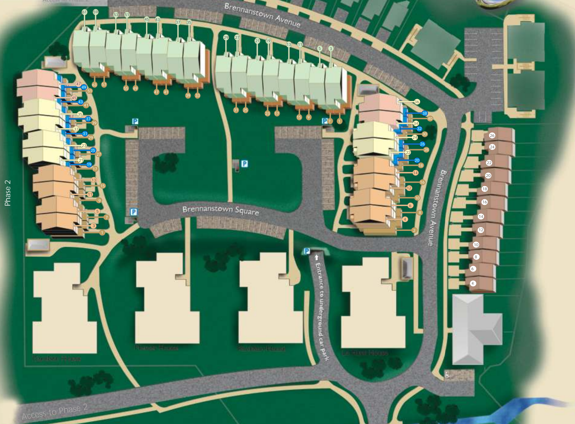
Le Hunt House